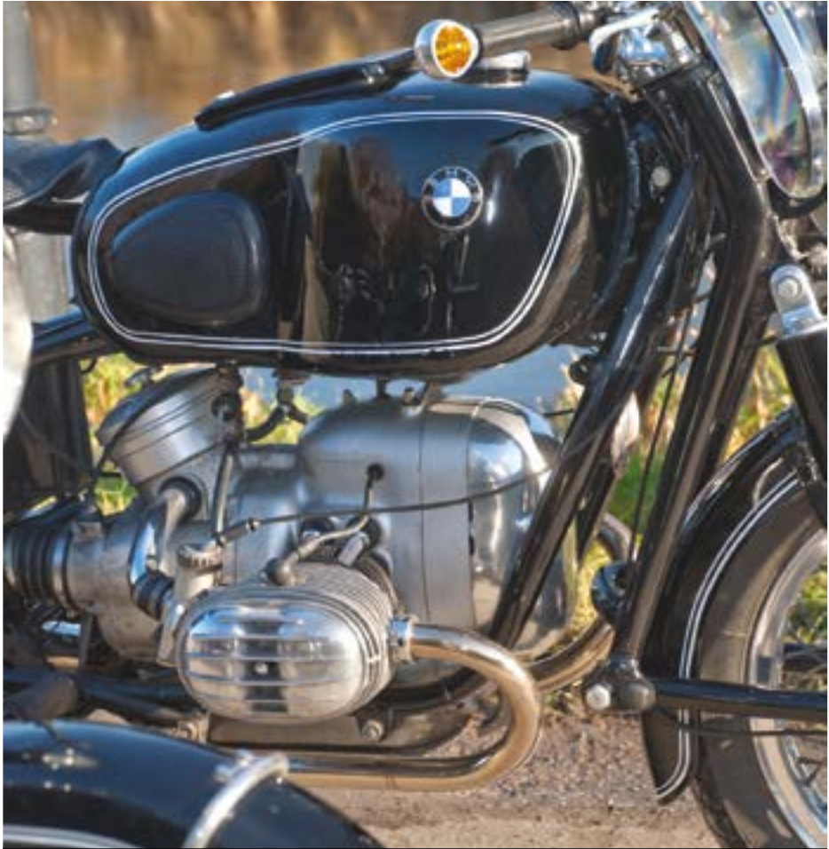
The large, polished casing at the front of the engine houses the highly durable electrics. Even though only 6-volt, the lighting is surprisingly good, we're told.