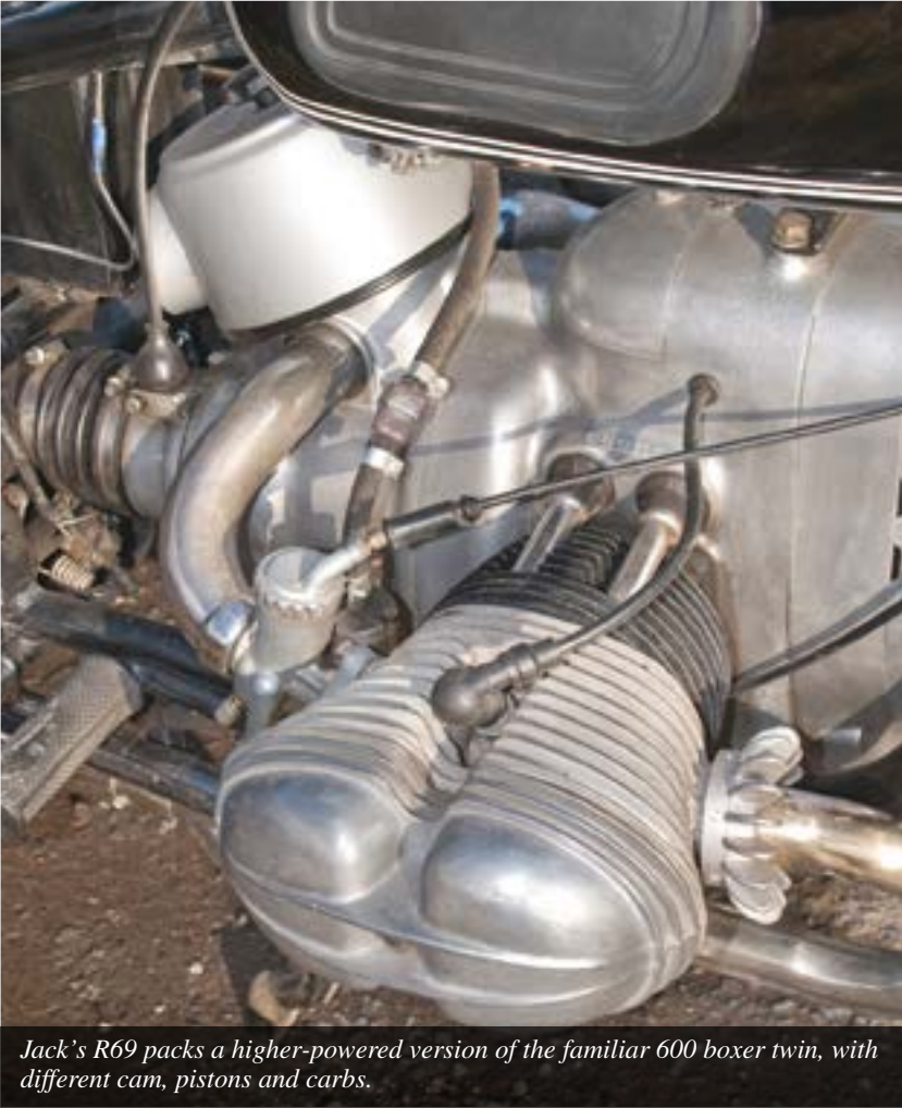
Jack's R69 packs a higher-powered version of the familiar 600 boxer twin, with different cam, pistons and carbs.