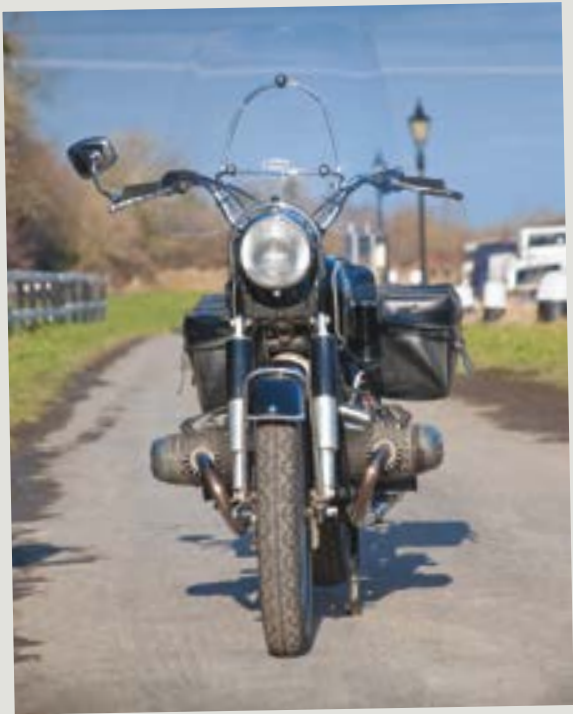
BELOW: Flat-twin's cylinder heads dominate the head-on view.

ON OUR KIND OF ROADS, THIS KIND OF TOUGHNESS AND RELIABILITY IS PERHAPS THE MOST VALUABLE TRAIT OF ALL, AND OVER THE LAST SEVEN YEARS THE THREE LADS HAVE BECOME MORE AND MORE ENTHUSIASTIC FOR THE BRAND, REGULARLY TAKING IN THE BIG BMW MOTORCYCLE RUN IN WALES EACH JUNE.