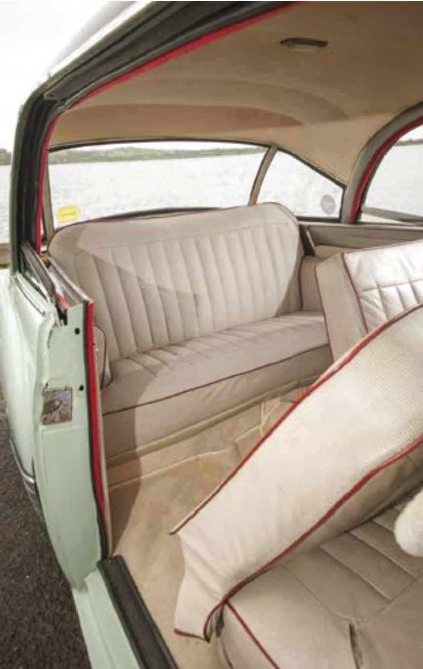
The wraparound rear window and lack of B-pillars give the driver fantastic visibility all round. If only modern cars were so easy to see out of.