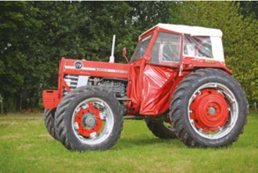
New canvases rejuvenated the Flexicab, which had fallen into disrepair in recent decades.