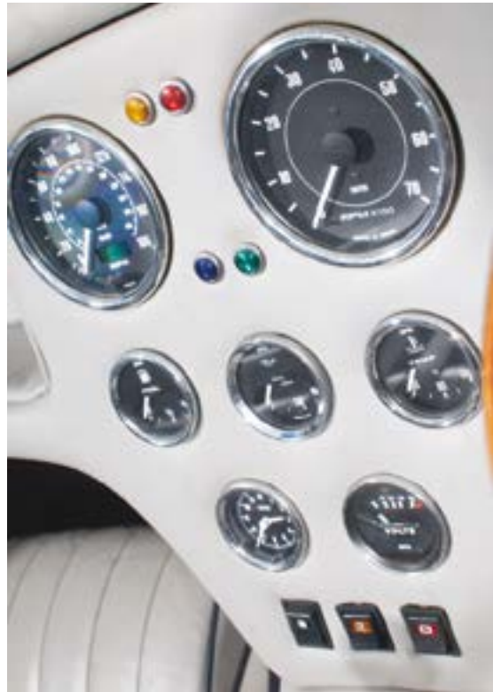
Although centrally mounted, the instrumentation is clear and well laid out.