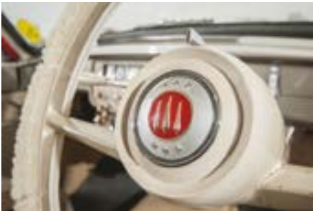
The indicator switch sits in the centre of the steering wheel, as was popular at the time.