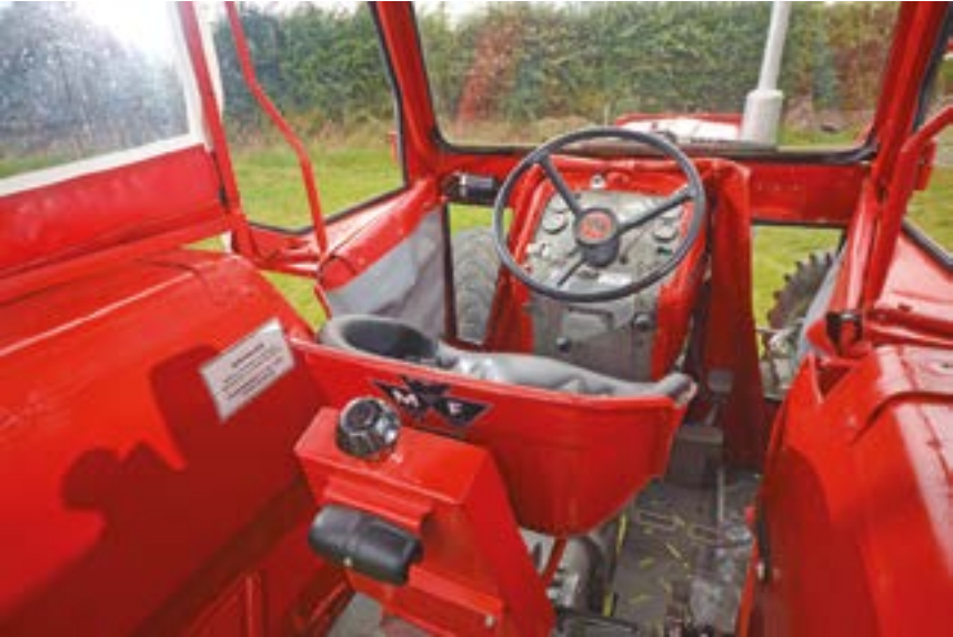
In the cab, you could almost be in a standard 178, until you look out of the windscreen, that is. Also, the extended transmission means that this cab is almost eight inches longer than usual.