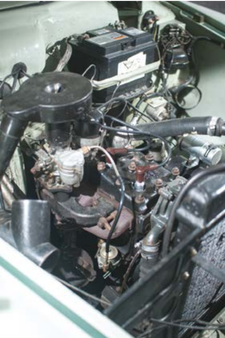
As this is an early 1954 model it features the 1,265cc sidevalve engine, which was replaced by an OHV 1,390cc later on that year.