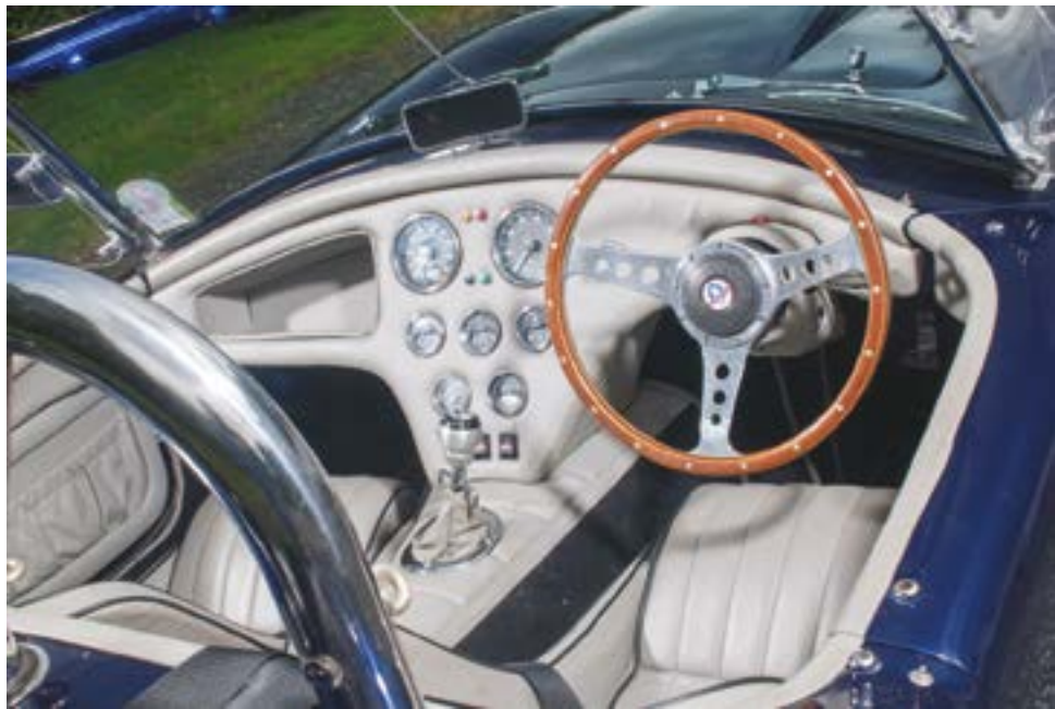
The grey leather interior has been well finished, which is just as well as it's on open show almost all of the time. The wiring loom kit used by the Dax utilises a Ford Sierra steering column, complete with its switches, which in turn acts on a steering rack from a Triumph Dolomite.