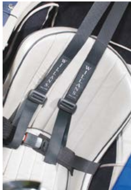
Willans harnesses look great and add a little racing toughness to the interior. Of course, they are also handy in preventing you from falling out at speed.

Speaking of engines, while it's possible to fit a V12 or straight-six into this Dax, almost all builders go for a V8 of some variety; it is supposed to be a Cobra, after all! Paddy chose a Rover 3.5 over the many American V8 options out there which, although very powerful and plentiful, are large and very heavy compared to the all-alloy Rover. Add to this the fact that you can mount the Rover farther back in the chassis and you're left with a far sweeter-handling car, with plenty enough power to be getting on with. Paddy managed to pick up a rebuilt 3.5 ready to go, complete with some choice mods already carried out including electronic ignition, a fruity cam and a four-barrel carburettor on a performance manifold, all good for a reliable 180bhp plus, and shed-loads of torque too.