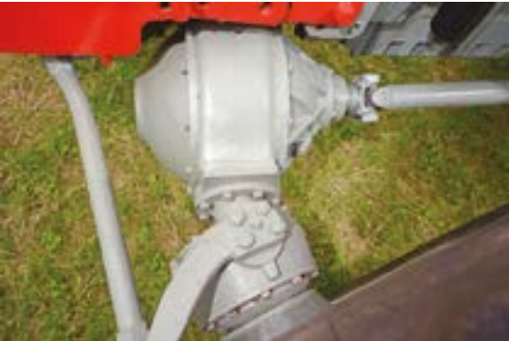
From the 'sandwich' transfer case by the gearbox, a propshaft delivers drive to the front axle.