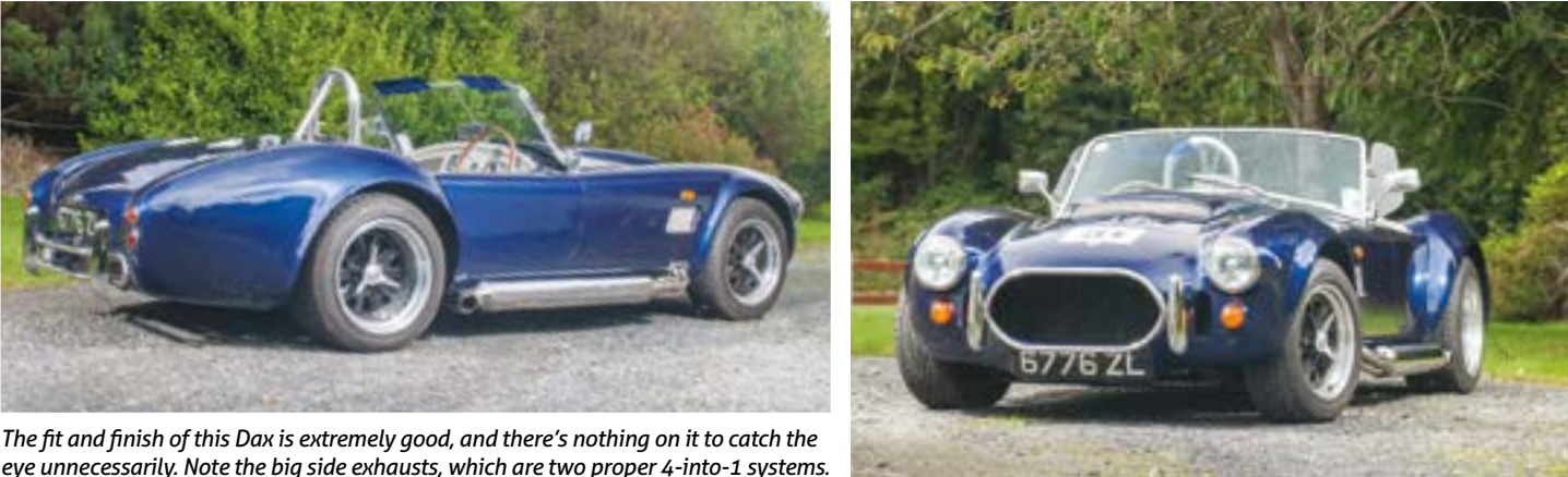
The fit and finish of this Dax is extremely good, and there's nothing on it to catch the eye unnecessarily. Note the big side exhausts, which are two proper 4-into-1 systems.