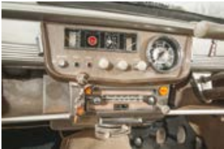
Stylish gauges and a lovely 'Philips Transistorised' radio inhabit the centre of the dash, plus a legend indicating the layout of the column-shifted gears.