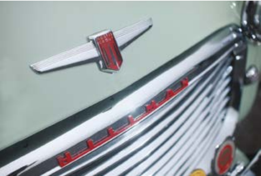
The Rootes Group envisaged the Californian as a car to appeal more to the US market, but its initial offering with an archaic sidevalve engine did its sales pitch no favours. The subsequent change to an overhead-valve unit failed to salvage the situation, and the car found few buyers stateside.