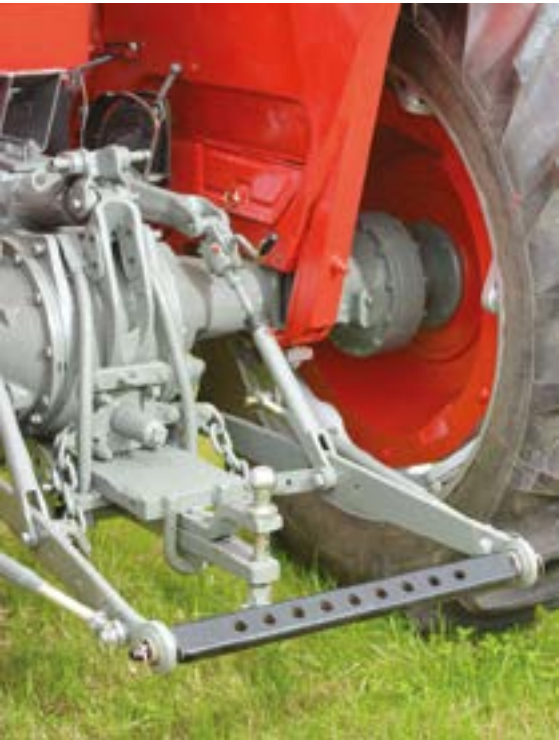
The drawbar has been modified over the years to better suit the rigours of working with the land-drive stone cart.

"The tinwork was mostly OK" Martin explains of the tractor's condition when they first went to strip it down. "The engine was smoky though and was burning a bit of oil, and the cab was in a bad state." The Flexicab fitted is actually worthy of further mention, as because of the extended transmission due to the sandwich plate the entire tractor, and therefore the cab frame, is six to eight inches longer than usual. Thankfully the cab frame was ok, although the original canvas coverings were in a bad way – most were missing, and the rear of the cab had simply been wrapped in an old truck cover to provide some weather protection for the driver. The tractor