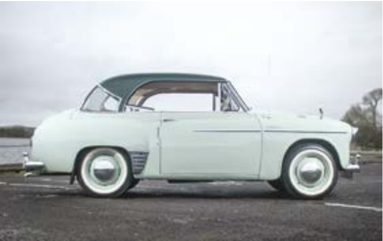
Whitewall tyres, two-tone paint and extra brightwork further lift the Californian’s looks over the standard Minx saloon.