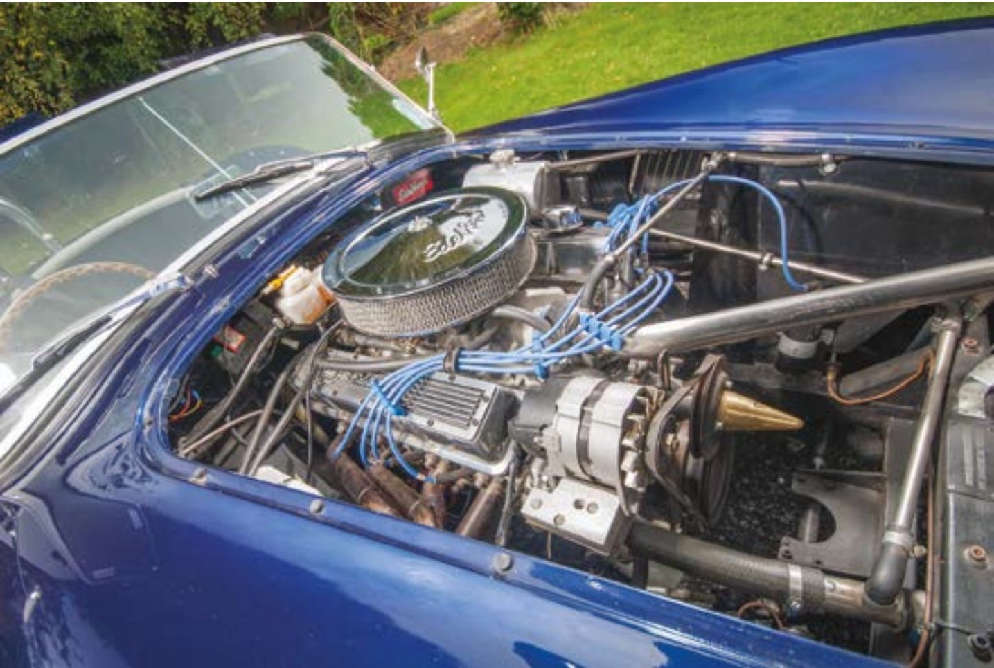
The Rover V8 fitted to Paddy's Cobra might "only" be a 3.5, but it's been well warmed up with a four-choke carb and manifold, electronic ignition and a hotter cam for north of 180bhp. Plenty of Edelbrock sparkle to be found too, with those eyecatching rocker covers and air filter. Note the tubular exhaust manifolds, which initially point forwards due to the constraints of the engine bay.