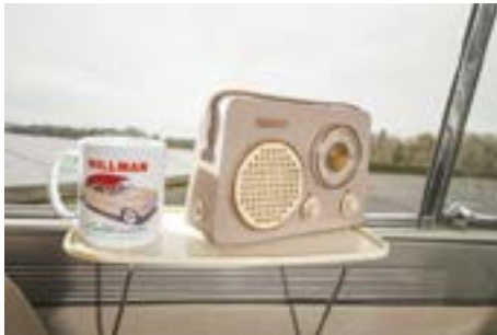
Accessory window tray holds the perfect items for a day out in the Californian; a picnic radio and a Hillman mug for the tae.