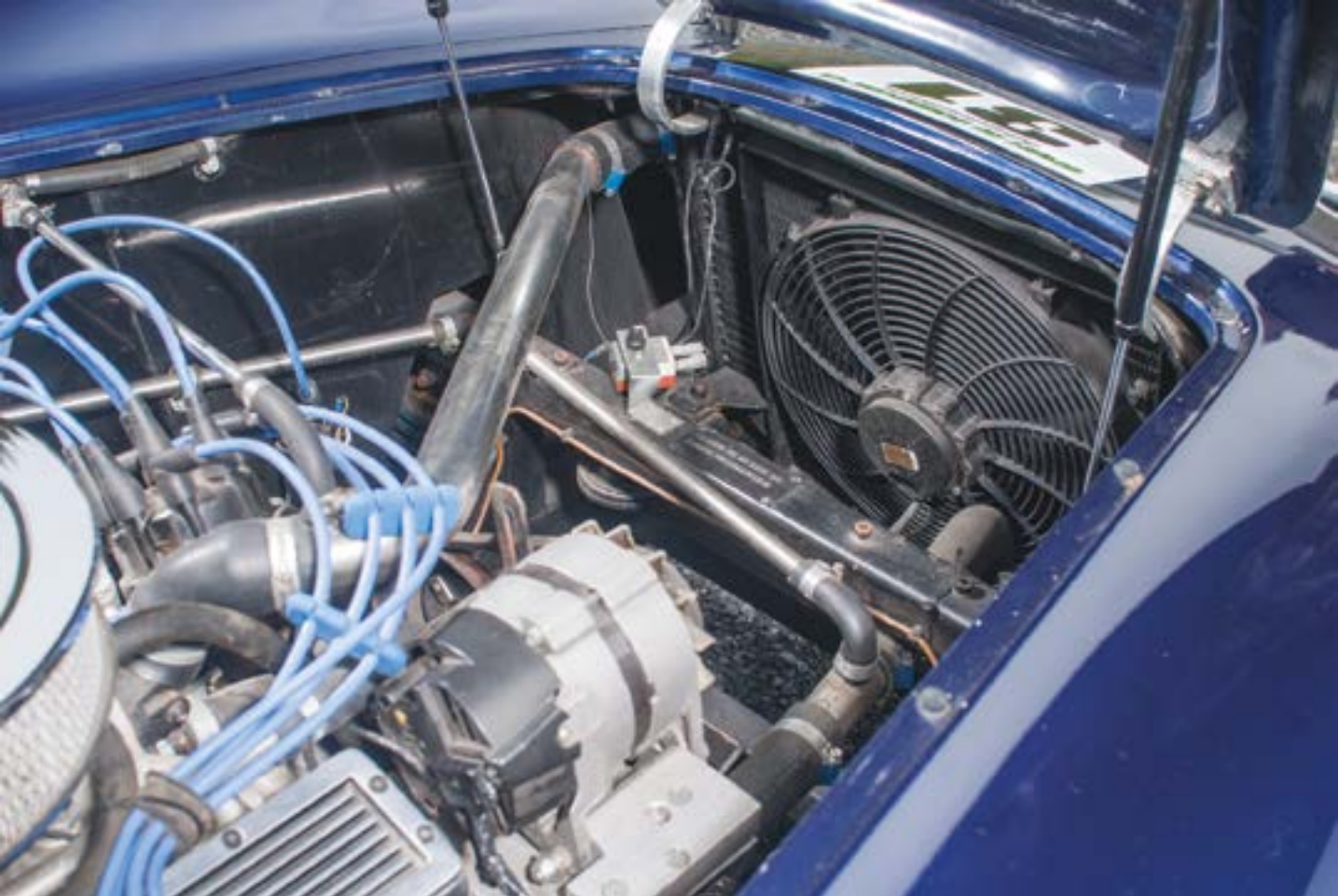
As it's smaller than the American V8s the Rover can be set well back in the frame for much-improved handling. You can see here how much room is left up front; the Jaguar V12 is also a popular engine choice for these Dax cars.