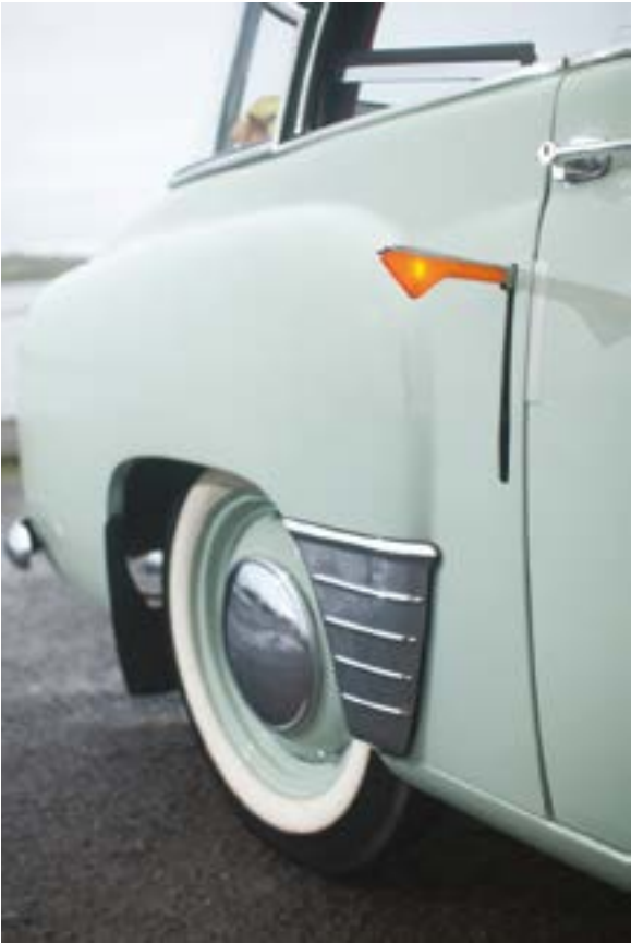
As there are no B-pillars (all of the side windows are retractable) the semaphore indicators had to be fitted in the rear quarter panels.