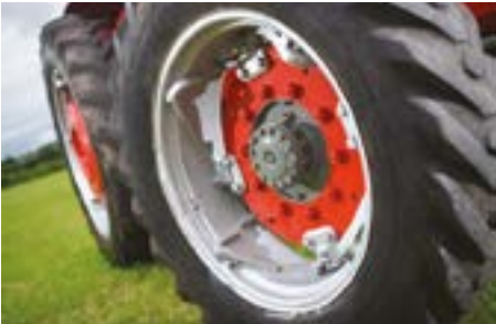
The front wheels are adjustable, and wear the same-size tyres as a 135 does at the rear!

SEE THIS RARE TRACTOR ON THE IRISH VINTAGE SCENE STAND AT THE NATIONAL PLOUGHING CHAMPIONSHIPS