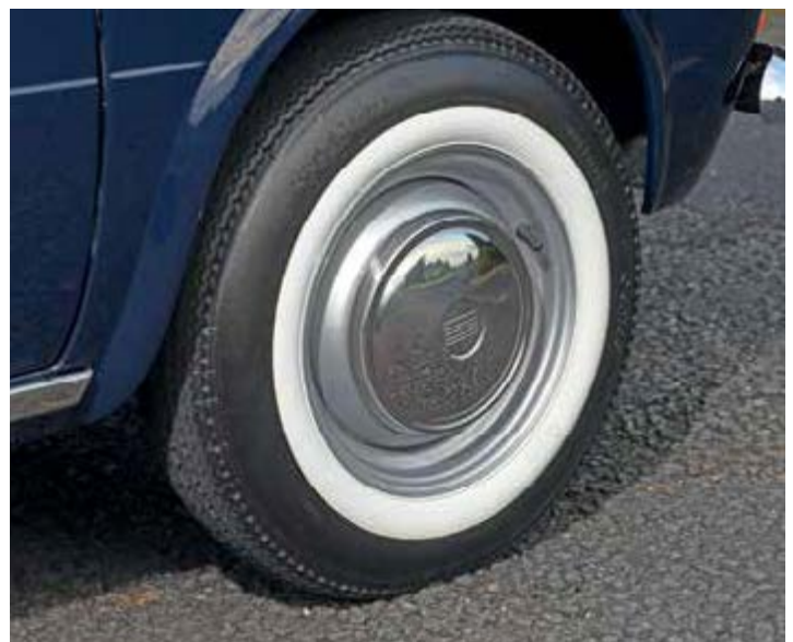
Dinky little white-wall tyres really add a splash of glamour to the little car.