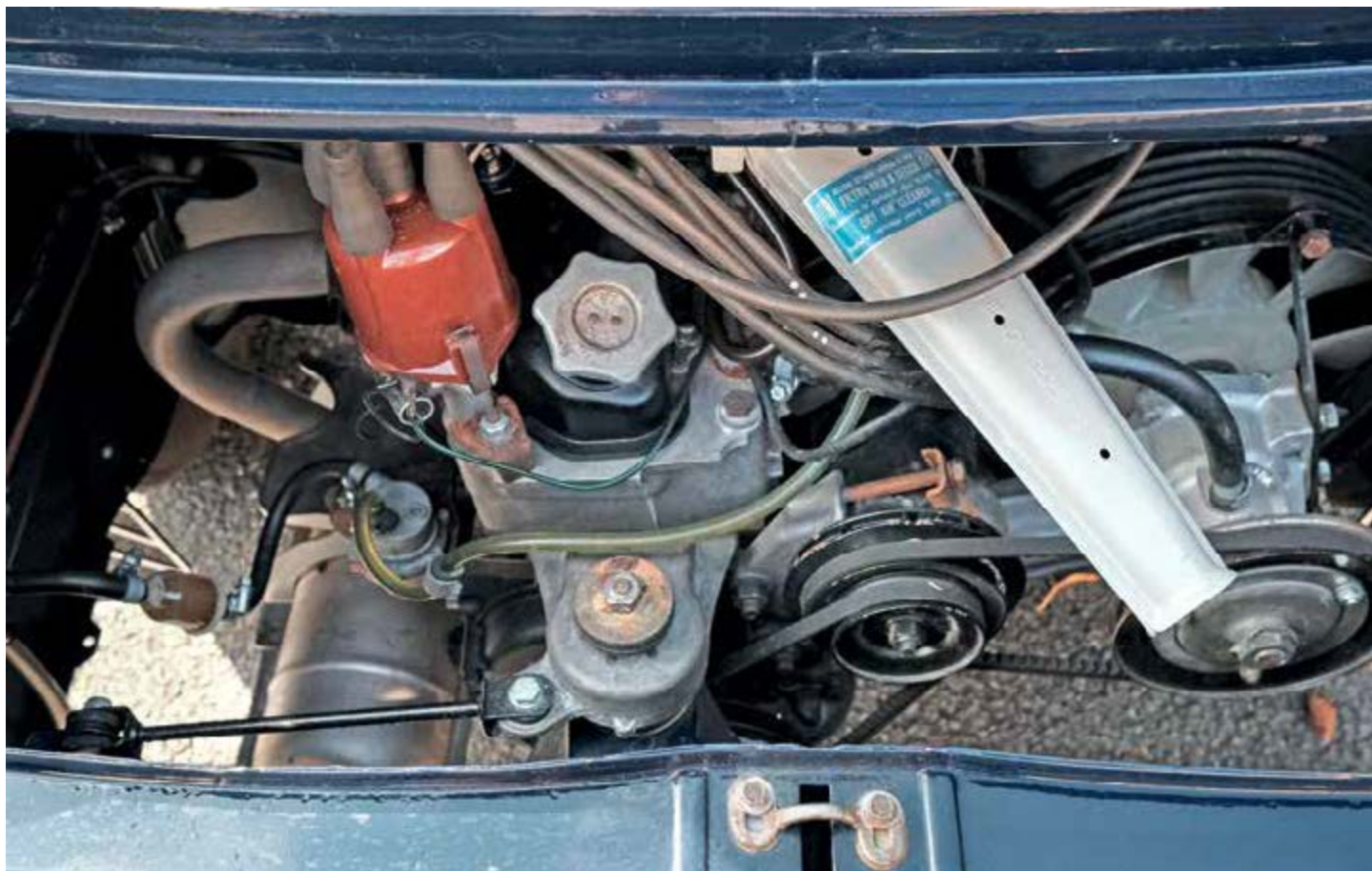
The four-cylinder, 843cc engine is water-cooled by a radiator mounted alongside, cooled by the fan visible on the upper right here. Given adequate maintenance it runs coolly and reliably.