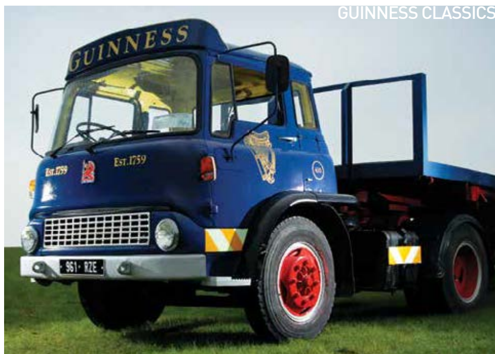
Bedford TK tractor and trailer an example of a highly popular truck for Guinness over the years.