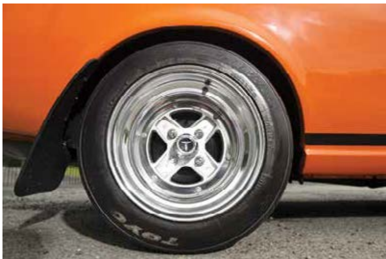
Measuring in at 11x14-inch, the rear SSRs are the definition of "fat"! We love the period Toyota centre-caps too.