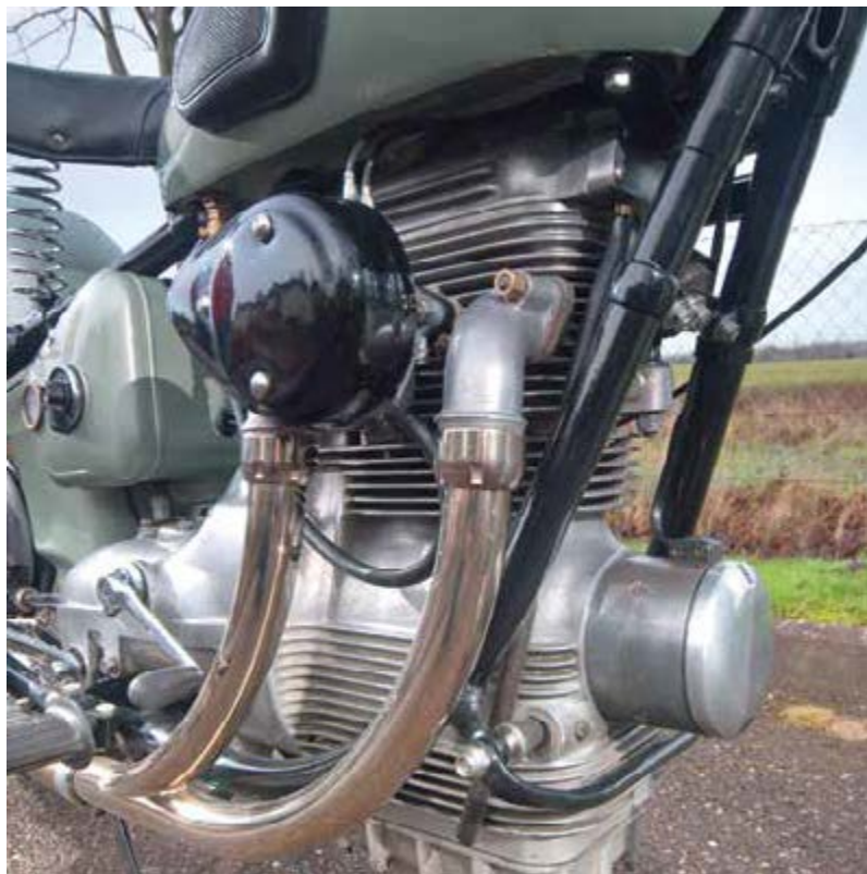
Inline two-cylinder OHC engine is fascinating, and very attractive thanks to those sweeping exhausts and teardrop air-cleaner; Brendan tells us the carb's proximity to the downpipes can lead to evaporation on occasion, one of the bike's few design flaws.