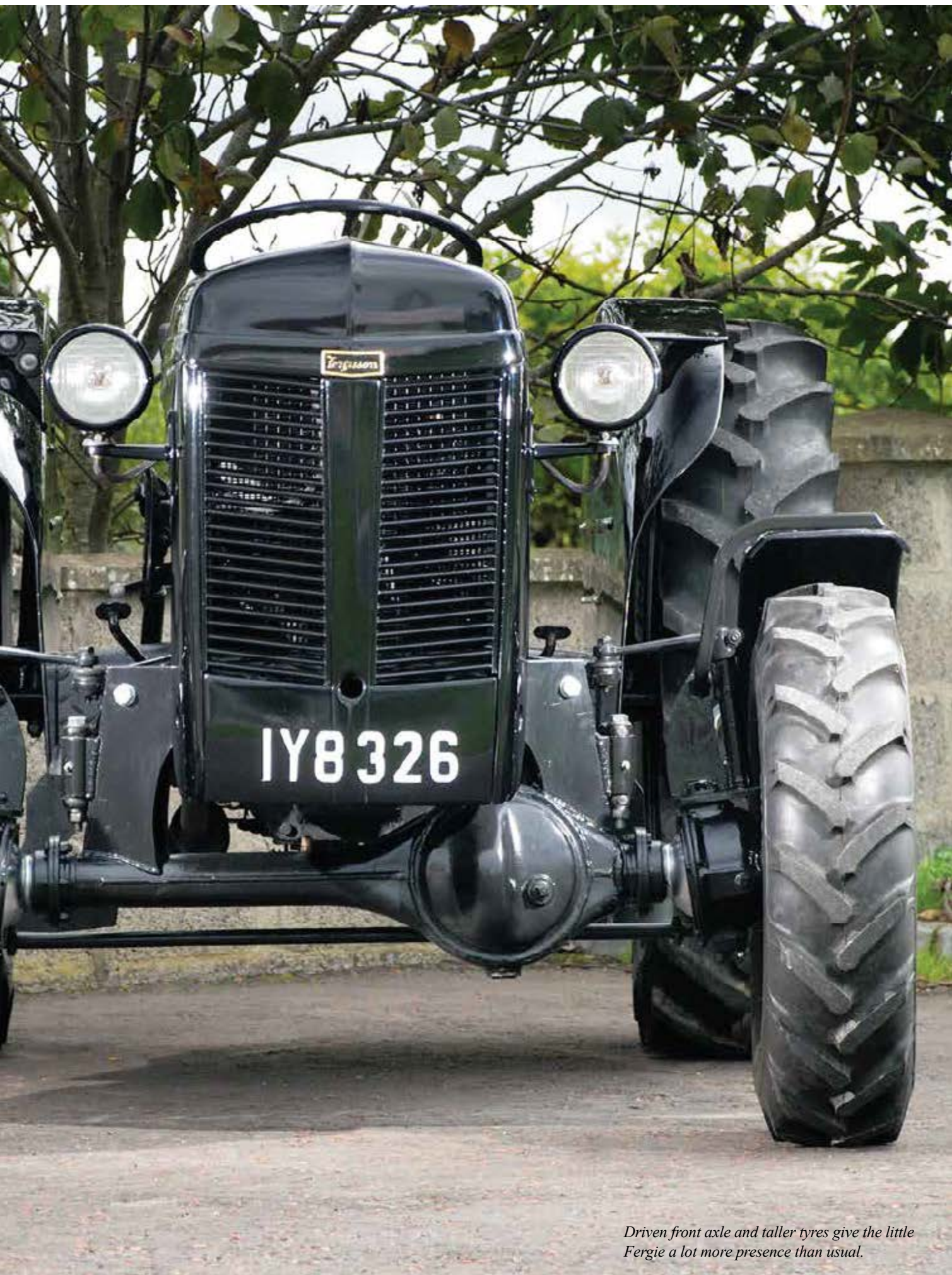
Driven front axle and taller tyres give the little Fergie a lot more presence than usual.