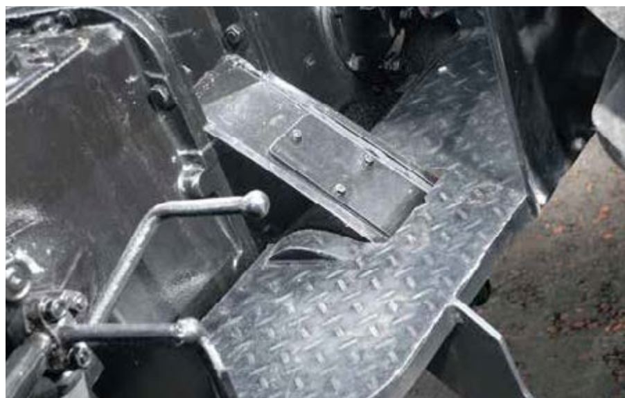
There's a lot of neat fabrication in this shot alone; the adapter plate sandwiched between the gearbox and axle looks almost standard, and a tidy inspection plate has been incorporated into the chain cover.

of tea or not, you have to admit that it's some eye-catcher, and sure enough, on the morning of our shoot a number of complete strangers stopped at the side of the road where we were taking the photos to have a closer look. A stunning and ingenious machine, it shows how the TE20 tractor might have been developed in the sixties if the newer models hadn't come along; as an inventor himself, we reckon Harry would be proud of this black beauty.