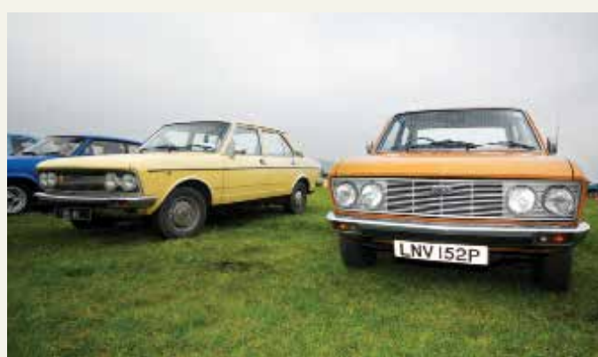
We haven't seen a Fiat 132 in a long time, let alone two parked next to each other! Both GLS models, the orange car is a 1600 and the yellow is an 1800 automatic.