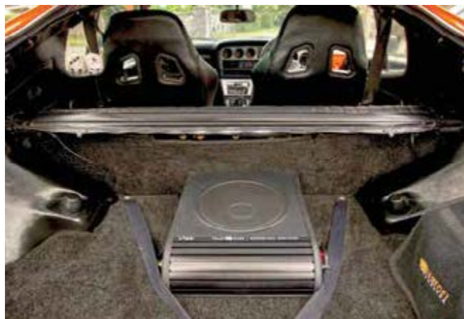
A beefy sound system has been fitted as unobtrusively as possible so as not to spoil the largely original interior.