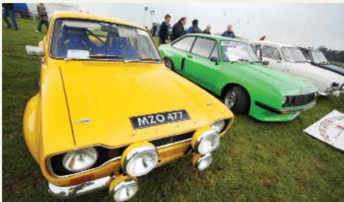
The bright yellow Escort RS2000 of Victor Hayes was one of many stunning retro Fords in attendance.