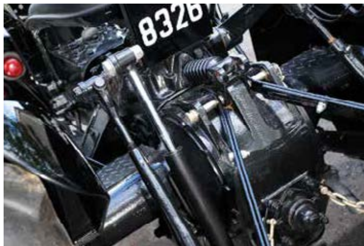
Hefty extra ram augments the usual hydraulic system at the rear.