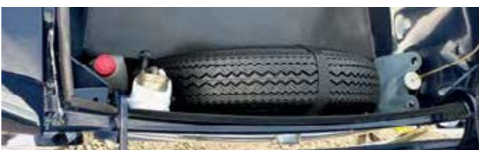
The boot up front, or "frunk" as it's apparently called now, is of a useful shape and size, and could easily swallow a few bags or shopping as well as housing the spare wheel and tool kit.