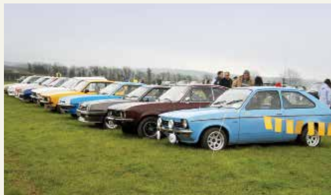
The RWD Opel crew were out in force, and had some great cars on display.