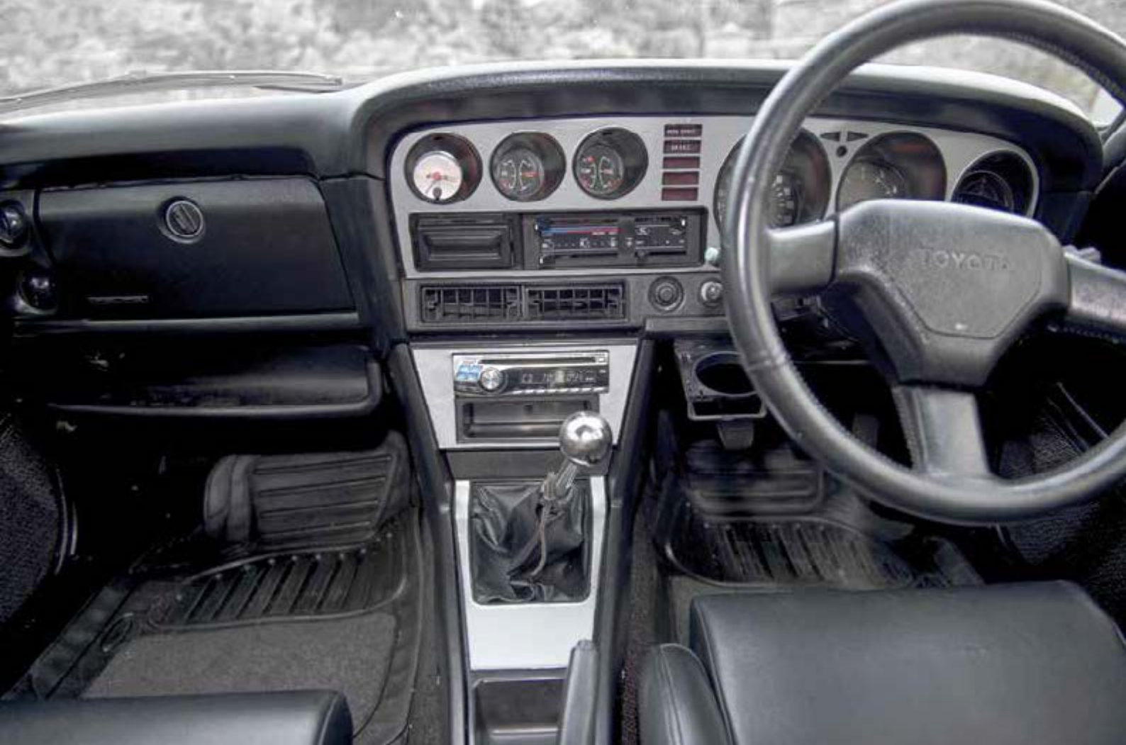
The GT has plenty of instrumentation to back up its sporty image. Note the later MR2 steering wheel, which keeps it in the family.