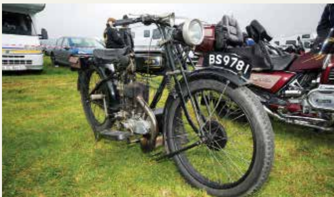
Durrow always attracts a good number of early bikes; this sidevalve 350cc AJ's belongs to Brendan Cowan, and is a 1925 model.