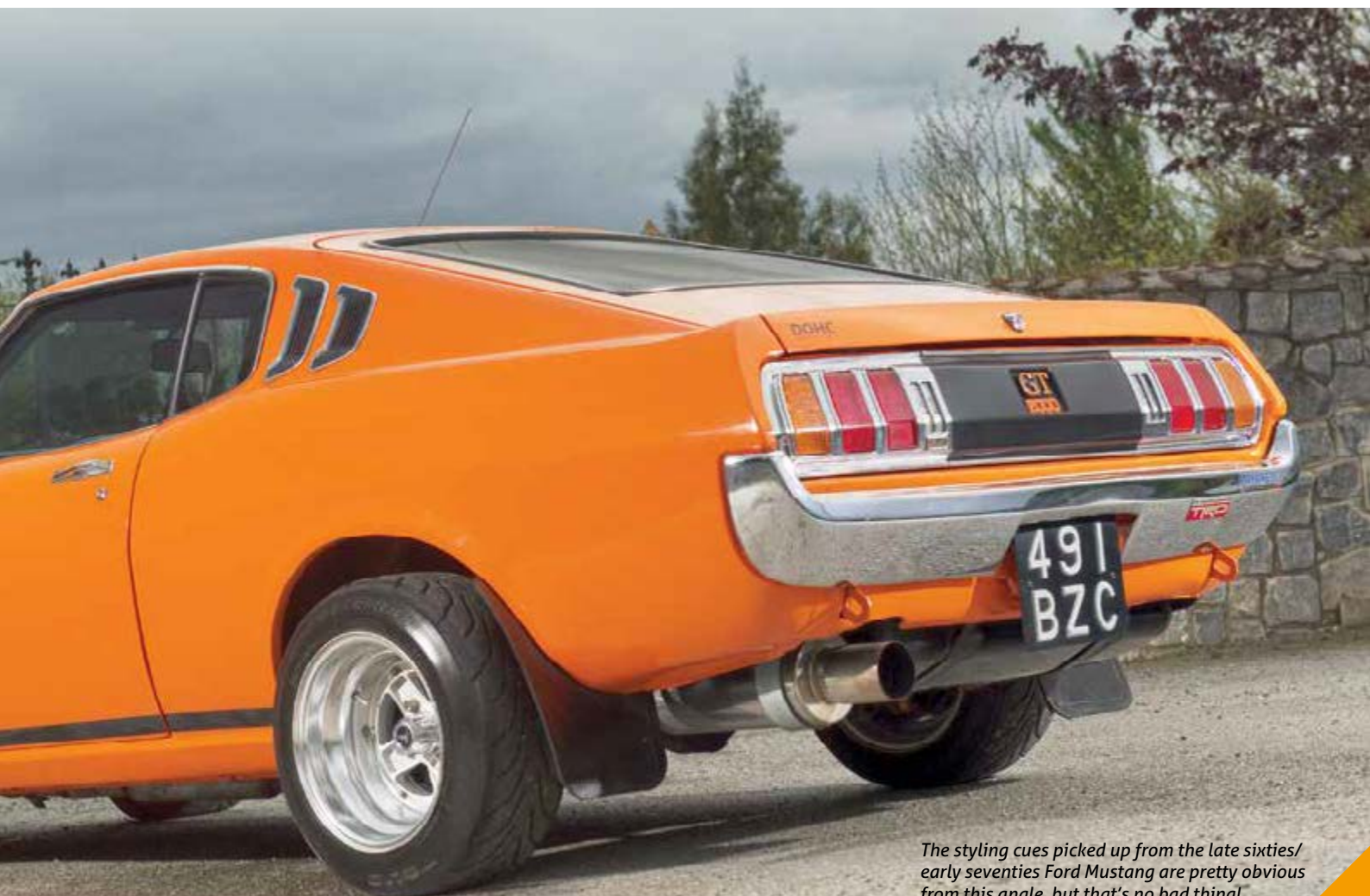
The styling cues picked up from the late sixties/early seventies Ford Mustang are pretty obvious from this angle, but that's no bad thing!