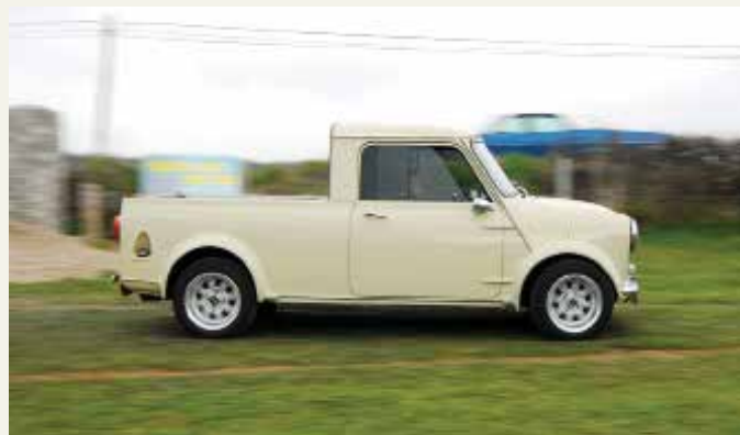
Mini pickups have become a rare sight, especially in this condition.