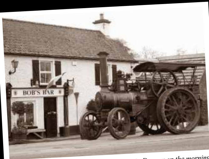
This steam engine resting outside Bob's Bar in Durrow on the morning of this year's show presents a rather timeless scene.