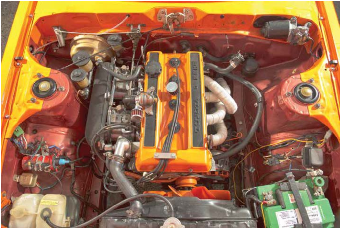
The 2000GT model was blessed with a 128bhp eight-valve two-litre twin-cam with dual twin Mikuni/Solex carbs. This one has only been mildly upgraded, but runs and sounds great.