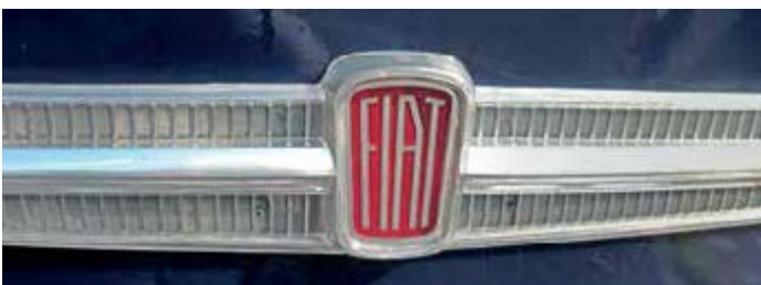
The mesh detailing of the front badge gives the impression of a grille to the 850's otherwise blank front panel.