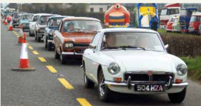
The Kilkenny Motor Club created a stir when their huge convoy of classics arrived en masse.