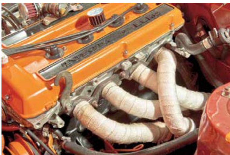
Heat-wrapped four-branch manifold frees a few extra horsies.