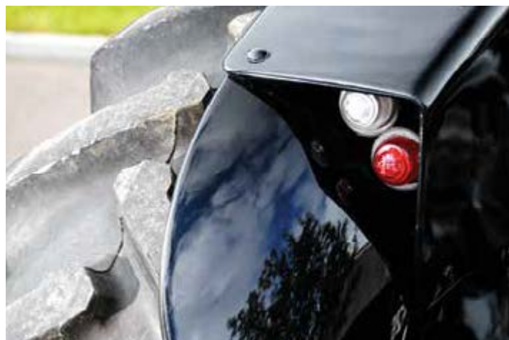
The appearance of the 35X mudguards is totally altered by these new top-plates and marker lights.