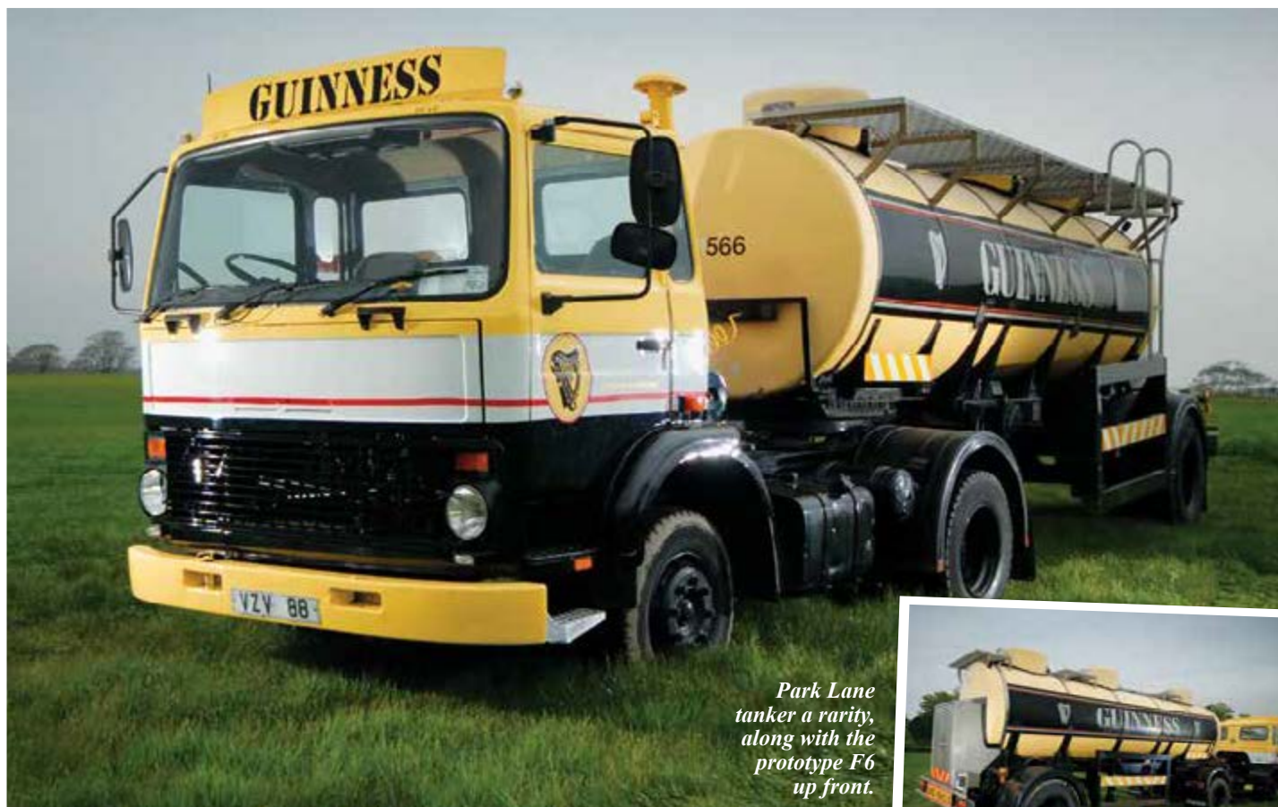
Park Lane tanker a rarity, along with the prototype F6 up front.