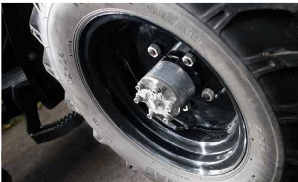
Front hubs are freewheeling items adapted from their usual Land Rover application.

The more you look at this tractor, the more you notice something different. For instance, the rear mudguards are in fact 35X items, which feature truck marker lights front and rear which sit under extra top panels also fabricated by Gerry. The PTO control lever has been moved to the right hand side (for reasons of space inside the rear end dictated by the new chain-drive), and the driver's access steps and foot-plates are all unique items made just for this tractor; their beefy appearance certainly fits in very well with this 20's off-road theme. Moving to the rear linkage reveals another surprise, as a hefty ram has been added to the hydraulic system in order to give the standard three-point setup a bit of a hand; this ram utilises the standard pump housed in the axle casing under the driver's seat. Speaking of the seat, this has been taken from a Ford 3000 and gives a level of comfort that the original 'pan' couldn't match. A number of components have also come in for the attention of the chromer, which look great against the straight black paint.