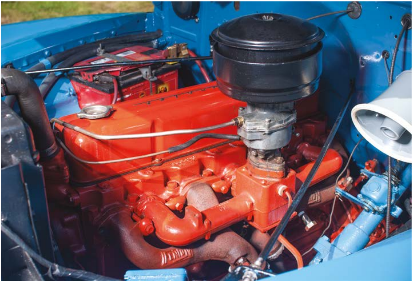
The venerable 3.1-litre Chevy straight-six might not emit a V8 crackle, but it's tough as old boots and has torque aplenty. Peter reckons this one's never been touched, and still runs just fine.