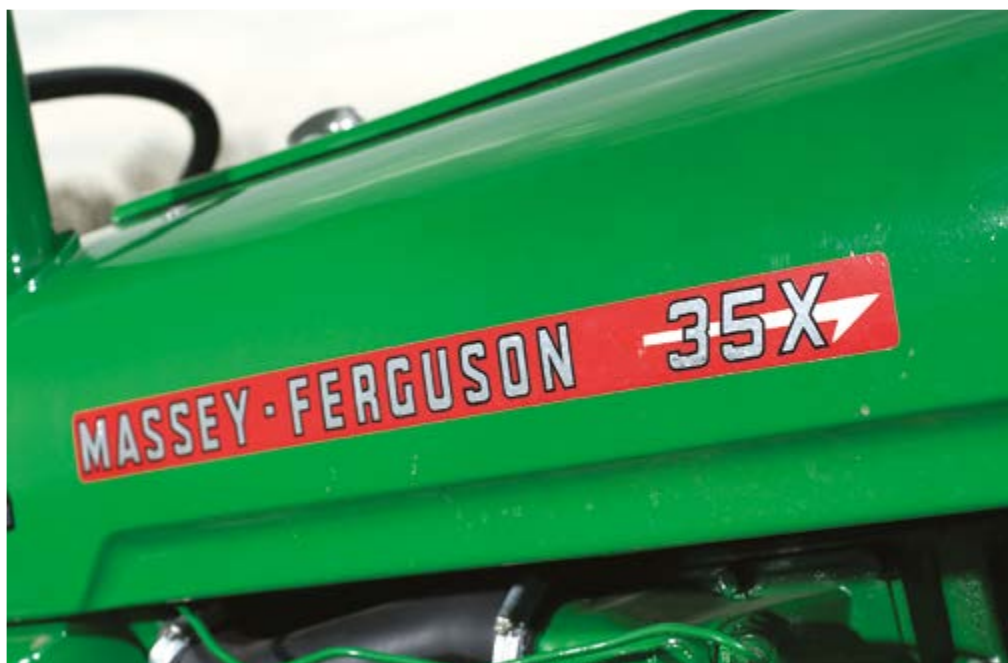
The 35X ran for only two years before the introduction of the 135, which would carry MF's small tractor range into the seventies.