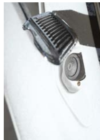
Above: Fuel cap is hidden beneath a hinged trim in the C-pillar.