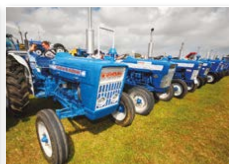
The Ford thousand-series was well-represented at the event, and the standard was extremely high overall.