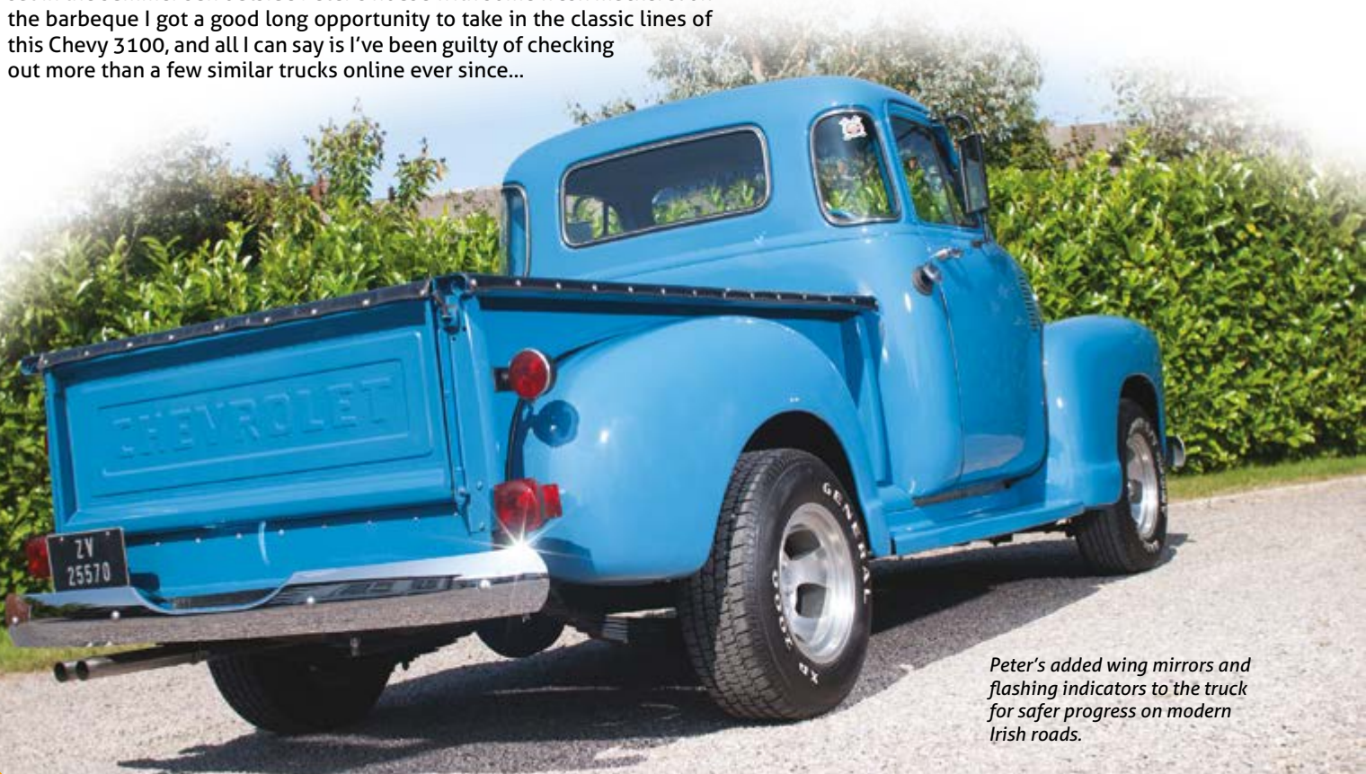
Peter's added wing mirrors and flashing indicators to the truck for safer progress on modern Irish roads.