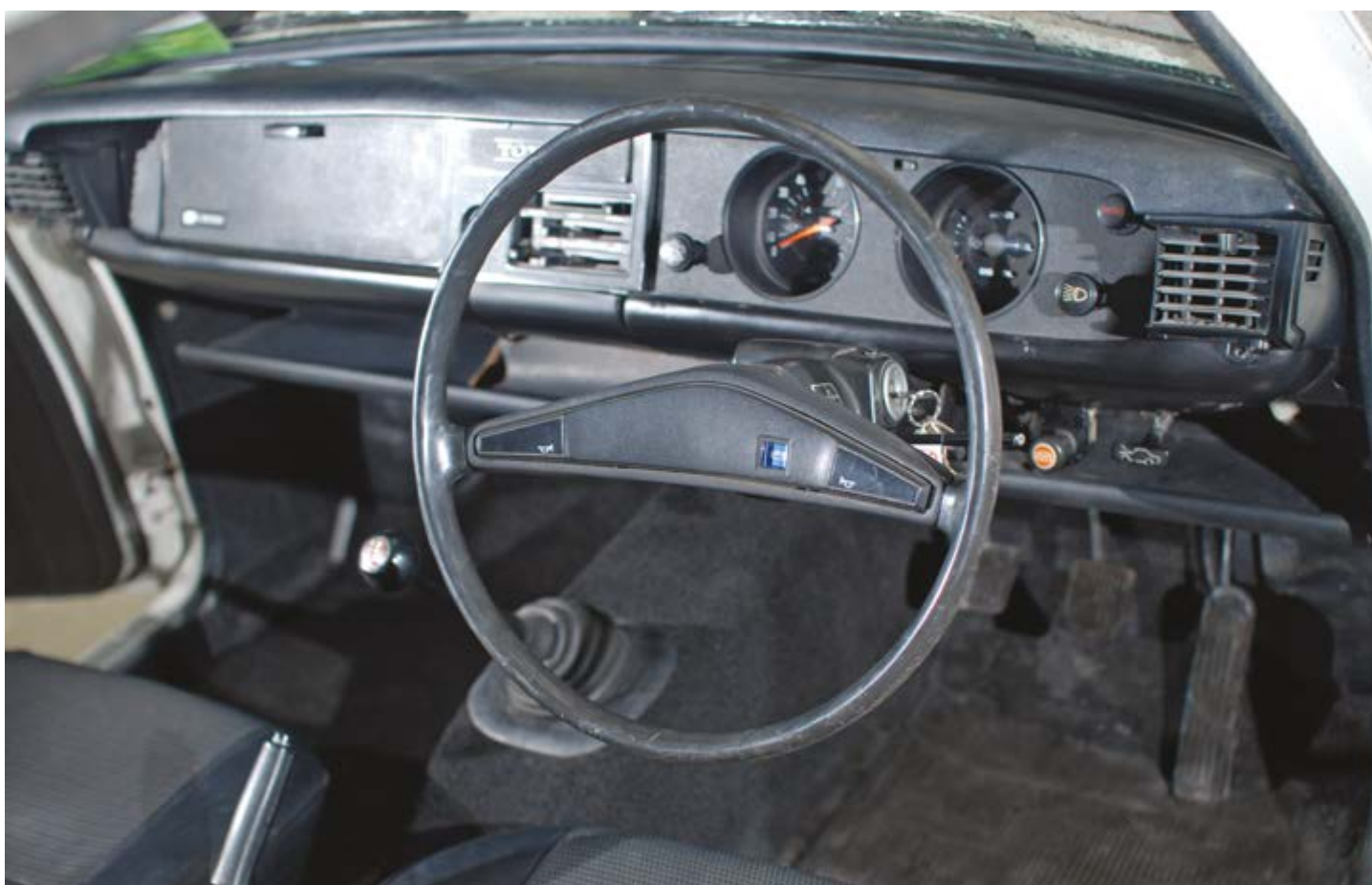
The black vinyl interior is entirely the car's own original. Even the factory radio blanking plate is still present in the dash, as a radio was never fitted.