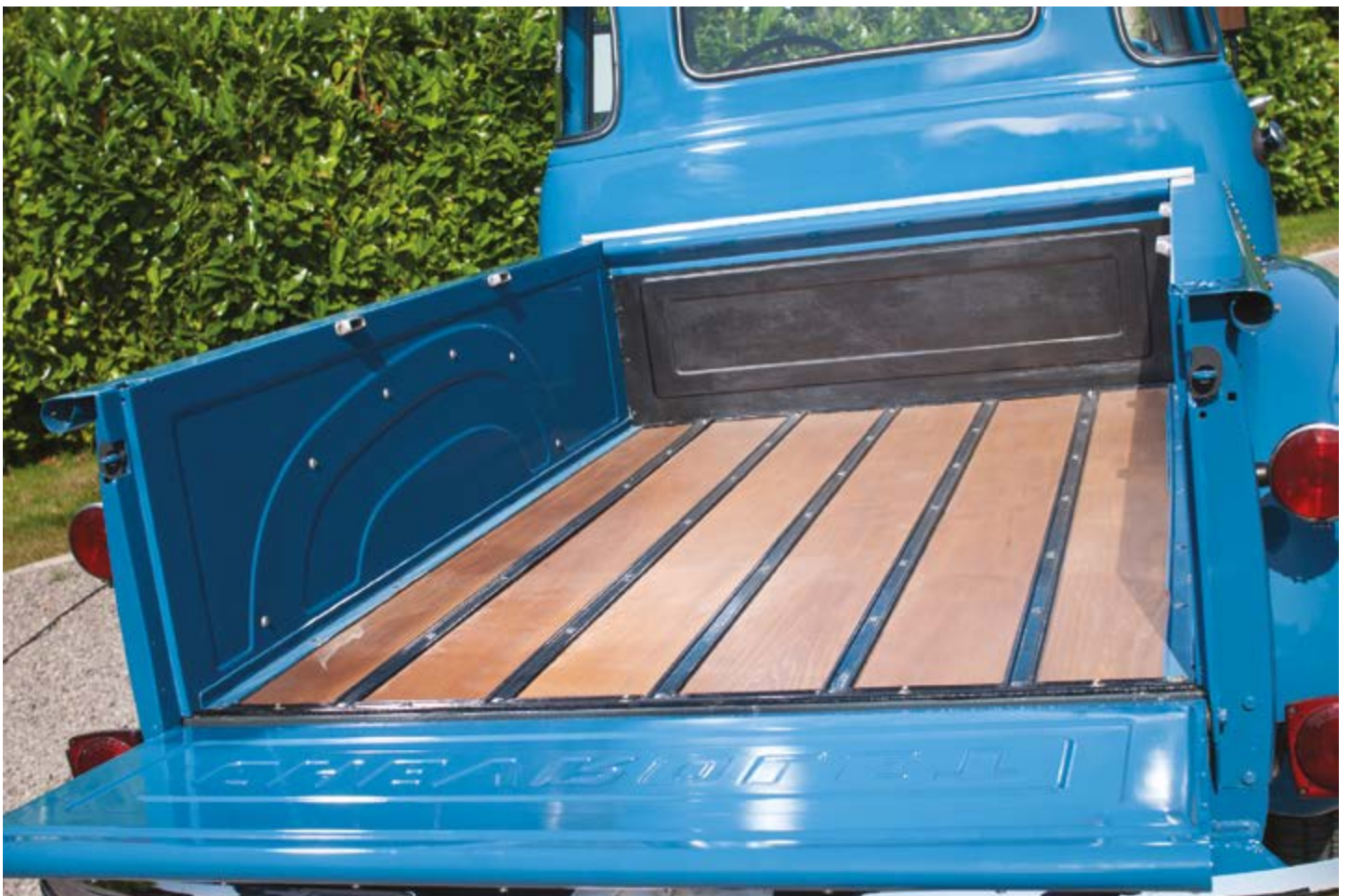
Beneath the new canvas bed cover lies a beautiful new wood floor. Peter won't be firing any concrete mixers or scaffolding in here in a hurry.