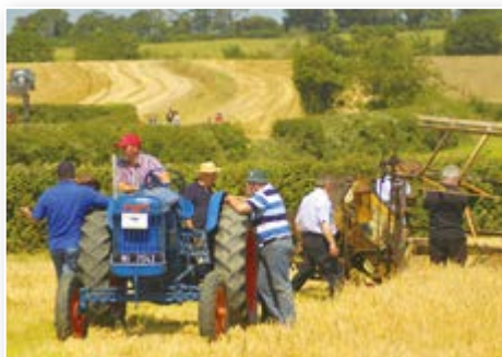
The expansive working areas gave plenty of scope for working your machine, or simply relaxing in the sun with friends.