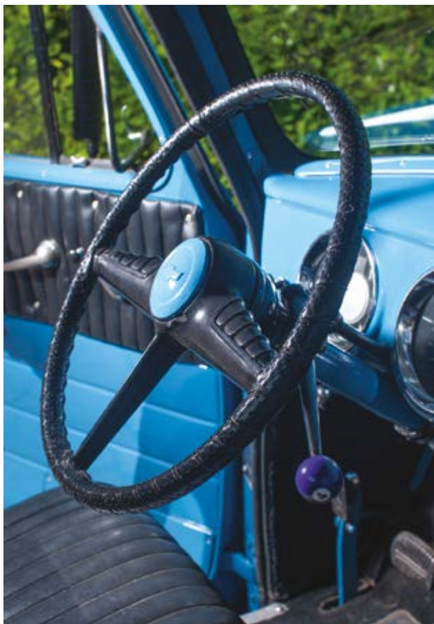
The three-speed manual has a column-shift, or as the Americans would say, "a three on the tree".