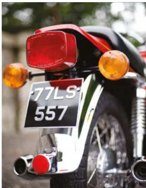
Even at the closest inspection, this bike is flawless.