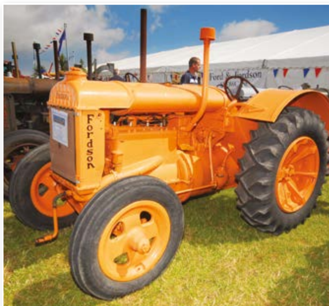
The orange Fordson era was well-represented by Tomás Cantwell's '38 example.

More pictures in our gallery section on www.irishvintagescene.ie