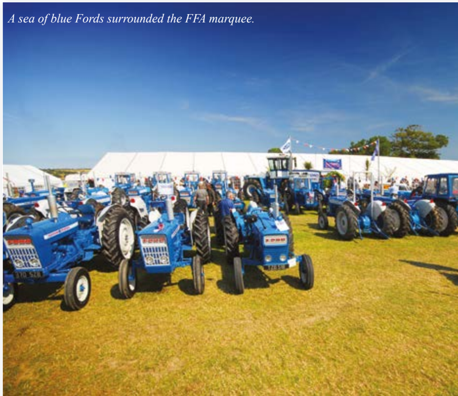
A sea of blue Fords surrounded the FFA marquee.

Elsewhere in the venue the special FFA marquee was proving another big hit with the public; packed to the rafters with rare and intriguing machines and incorporating a hospitality area, video presentation area and a merchandise stand, it was the perfect place to get some respite from the glorious sunshine outside. Surrounding the marquee was a sea of (mostly) blue, with around 460 Ford and Fordson tractors and derivatives on display; one could easily lose oneself in row upon row of Henry's finest. A lively award ceremony at 4:00pm on the Sunday rounded off the Ford & Fordson Association proceedings nicely, and well-done to all winners; a list of first-place winners in each category can be found below.