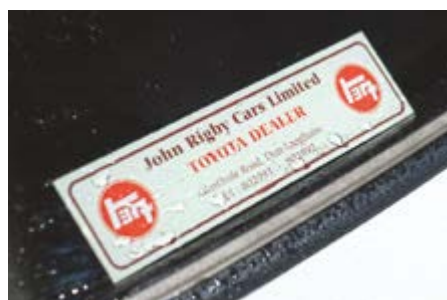
The original dealer sticker has been recreated for the rear screen.