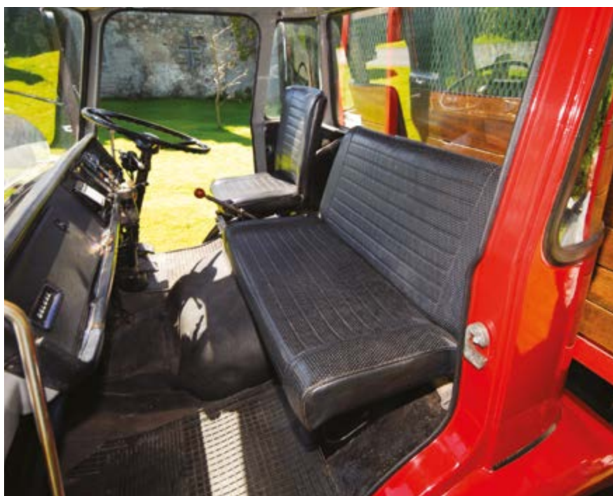
Interior is as tidy as the rest of the truck.

It goes without saying that most vintage and classic enthusiasts have a close bond with their favourite vehicles: car fans enjoy cruising around in the kind of motors that they either wanted as a kid or that their parents had when they were growing up; tractor fans, due to their close working relationship with their machines, relive memories of the loyal service given by the Fergies, Fordsons and Deeres on their home farms; motorcycle fans get nostalgic about the racers and trials bikes of their heroes. However, perhaps classic truck fans have the most passionate bond of all. These guys spend many hours a day behind the wheel, getting to know every knock, rattle and squeak of their truck in the process. The truck is often their source of livelihood, their breadwinner, and on long trips its cab even becomes a home away from home, offering dining quarters and sleeping accommodation. The driver's name and locality are often emblazoned across the bodywork, both as a means of attracting new business and as a point of pride in his profession, further adding to the relationship between the truck and driver.