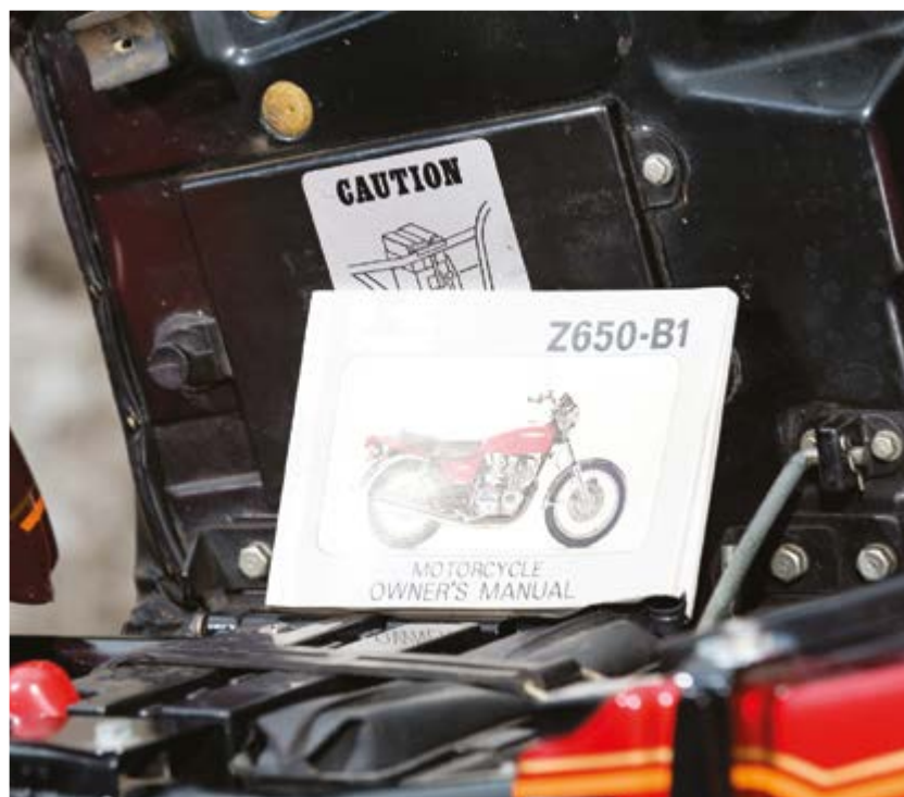
The bike even has the original owners manual intact.