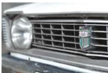
The KE20 was the model that really saw the Corolla hit the big numbers, becoming the best-selling car worldwide by 1974.