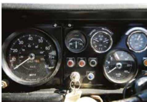
No doubt a familiar dash to many old-time truckers.