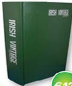
IRISH VINTAGE SCENE BINDER