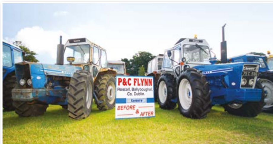
This clever 'before and after' display of County's brought a smile to our faces.