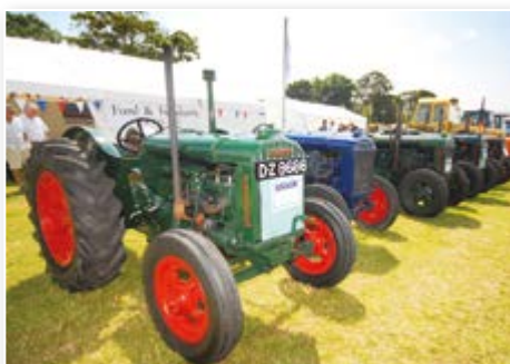
Rodney Getty's '44 Standard N heads up a line of similar brethren.