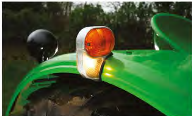
Attractive sidelights are also German.