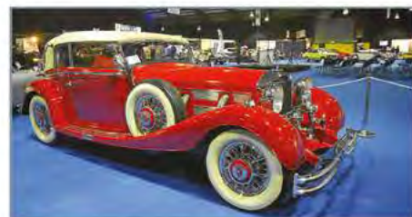
The special feature stand of the Mercedes-Benz Collection had some of the standout cars of the event, including this magnificent 1936 500K, which took the award for 'Car of the Show'.