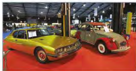
The Citroen Car Club's display cars reflected the diversity evident in the cars built by that manufacturer over the years. Here, a utilitarian 2CV rubs shoulders with a low-slung Maserati-engined SM coupe.