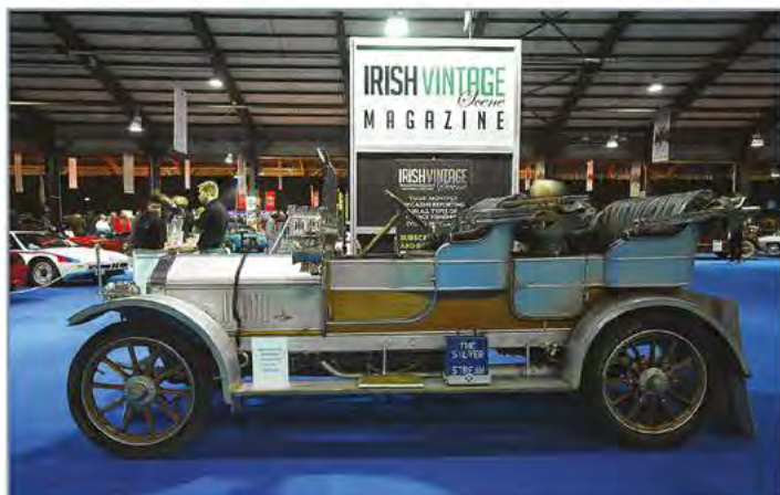
...While the Silver Stream was the brainchild of a Kildare engineer, the prototype for a prospective run of luxury cars in the years approaching 1910. This unique car has survived in remarkably original condition, and before this show had not been seen in public for some time.