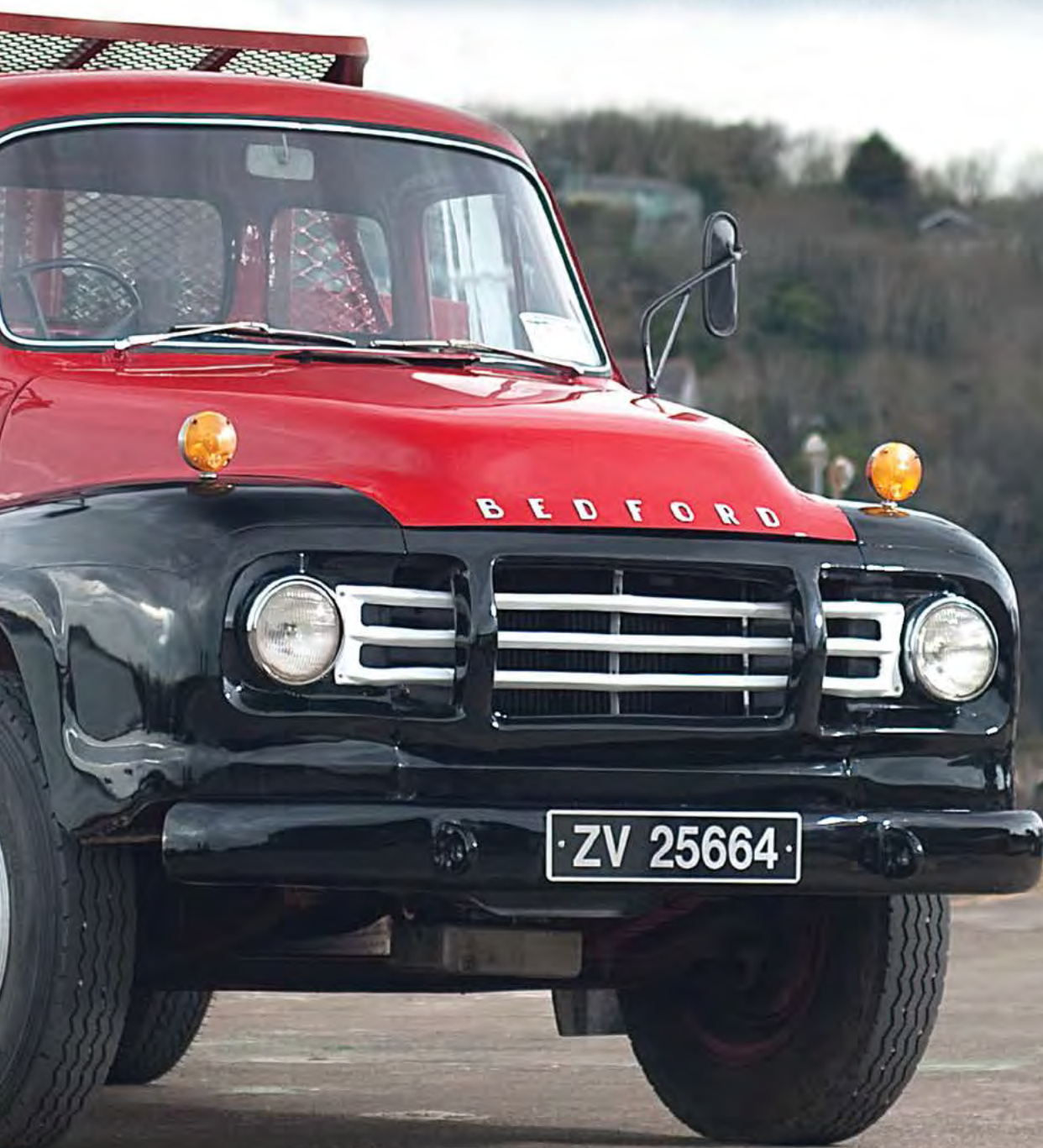
This Bedford JS has undergone a complete transformation from its garishly-liveried existence in Malta, and is now a very fine example of the breed.