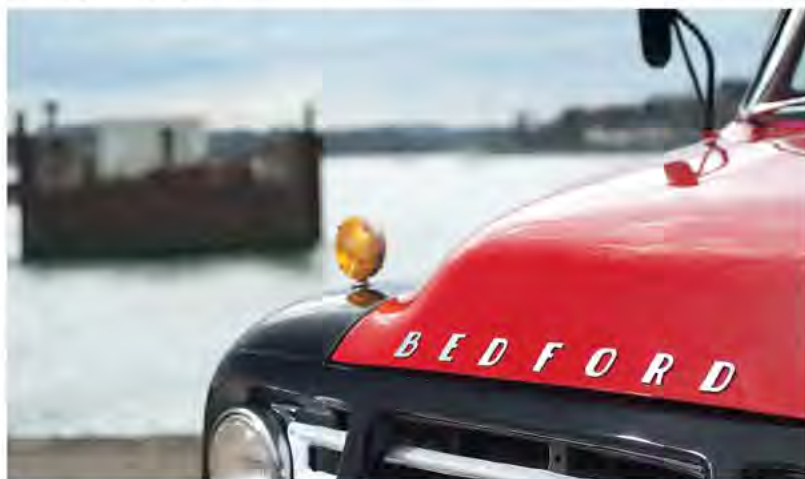
IRISH VINTAGE SCENE WOULD LIKE TO ACKNOWLEDGE CORK PORT IN COBH FOR THE USE OF THEIR PREMISES FOR OUR PHOTOSHOOT.