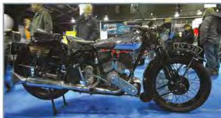
Not all of the dream machines at the show had four wheels. Noel Barber's 1936 Brough Superior SS80 drew much admiration on the Munster VMC&CC stand.