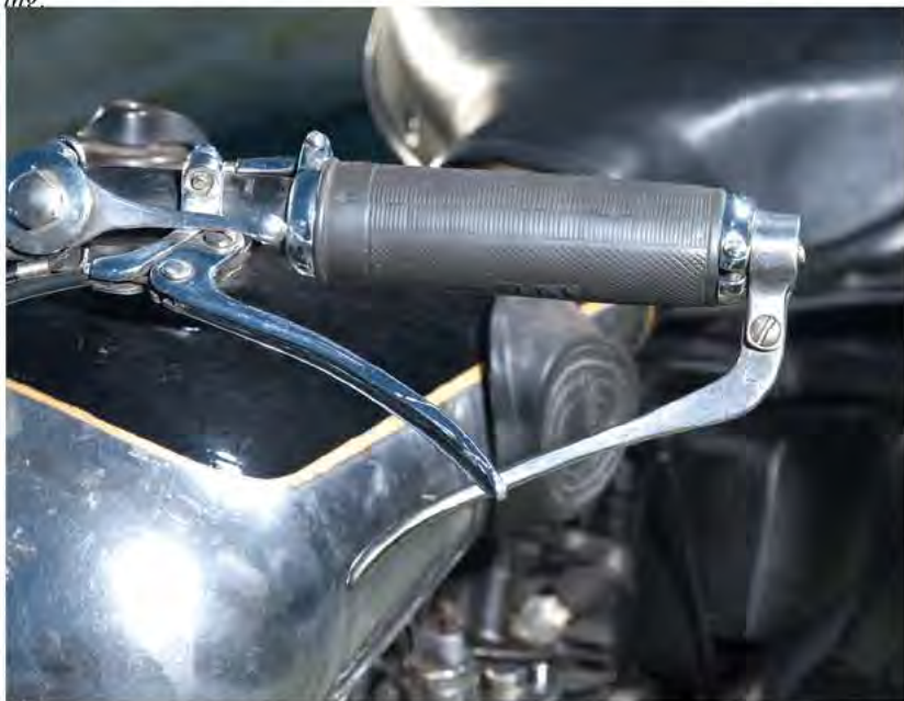
Handlebars feature both conventional and inverted handles. Both sides feature twist grips, one for the throttle and one for the advance/retard mechanism.