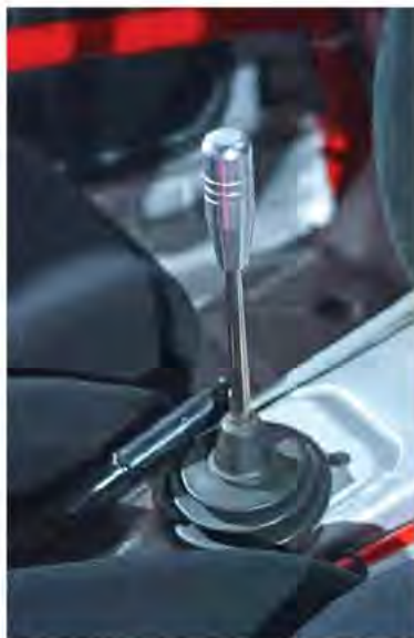
The elegant alloy shifter stirs a Ford Type-9 gearbox.