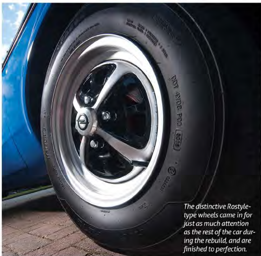
The distinctive Rostyle-type wheels came in for just as much attention as the rest of the car during the rebuild, and are finished to perfection.