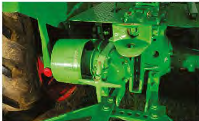
Belt pulley is easily removable to gain access to PTO.

machines as an alternative to the horse. Xaver Fendt and Co. was established in December 1937, and by the following year the 1,000th Fendt tractor had been built.