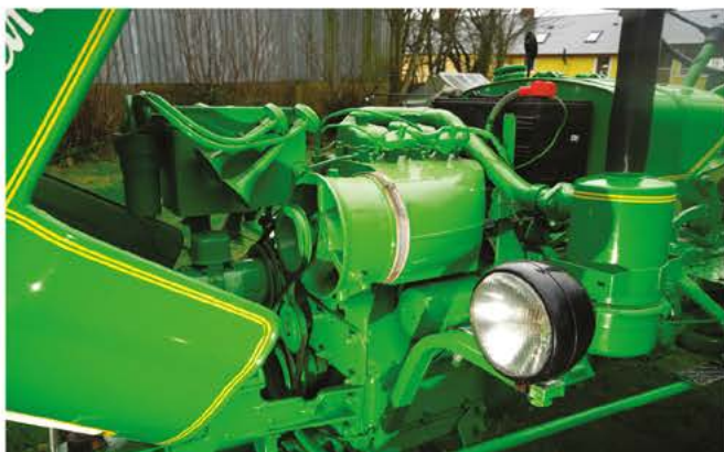
Twin-cylinder diesel is dominated by the cooling fan and ducting.

Bought in Dundalk in 1999, it was sourced from Belgium where it had spent most of its life, and a small French plaque on the bonnet indicates that the tractor also has French origins.