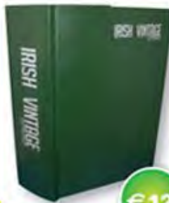
IRISH VINTAGE SCENE BINDER