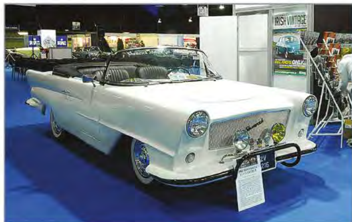
The Irish Vintage Scene stand was graced with two very special, Irish-conceived automobiles. The first, the Shamrock, was the product of an ill-fated 1960 attempt at full-scale production of a US-market car in Castleblayney, Co. Monaghan...