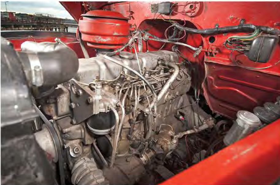
The big six-cylinder Perkins 6354 is a familiar beast to Billy, as it was used in many industrial and marine applications. This one replaced the original six-cylinder petrol at some stage in the truck's past, but runs nicely after some remedial work was performed.