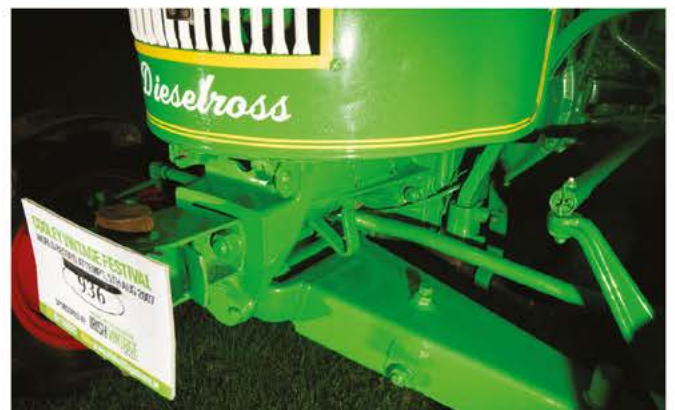
Ingenious split front axle is leaf-suspended.