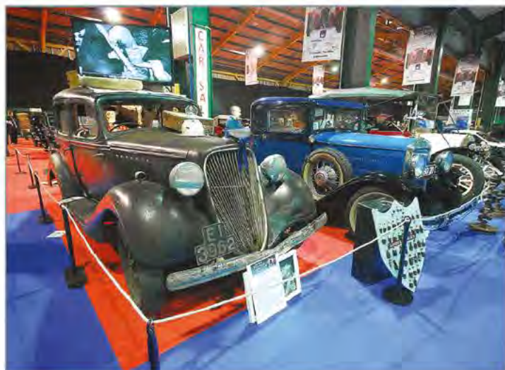
The most talked-about exhibit had to be the prize-winning display by the Connacht Pre-War Enthusiasts, mainly as a result of this 1937 Hudson Terraplane "barn-find" and its skeletal driver.