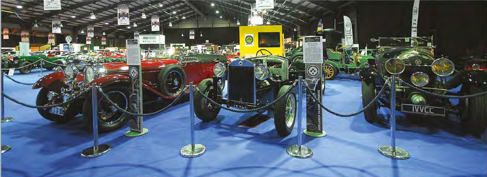
The IVVCC stand was positioned just inside the main entrance, and had some stunning machinery to savour: The 1928 Mercedes-Benz S-Type, 1929 Lancia Dilambda rolling chassis and 1928 Bentley 6.5-litre shown here were just a few of the standouts being exhibited.